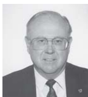
by Gene Page SCORE counselor

Our local chapter of SCORE ("Counselors To America's Small Business") found itself facing increasing costs for the binders and papers needed to create handouts for our monthly workshop. "Starting and Managing a Small Business." After deciding to convert our hard copy/paper material to a CD, we achieved the following results: