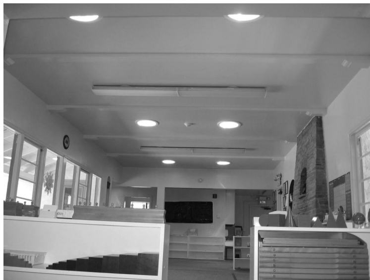
Classroom with daylighting system

Daylighting systems, such as tubular daylighting devices and skylights, can make a positive difference in addressing these issues. They provide a way to reduce electric energy bills in the daytime and save money, while also making a positive "green" improvement. Décor is improved due to the quality of light in the room (also known as "color rendition.") Regarding SAD, several prominent studies have shown that increasing daily exposure to natural light can enhance mental and physical well-being, boost concentration and energy levels, and provide a number of other unexpected perks. The leading tubular daylighting systems offer the most advanced, patented technology available, and can be installed on any roof type. Usually with a choice of 10" or 14" diameters, or even 21", these devices can brighten an area of 150, 250, and 400 square feet or more respectively. Do-it-yourself kits are available, or any of these products