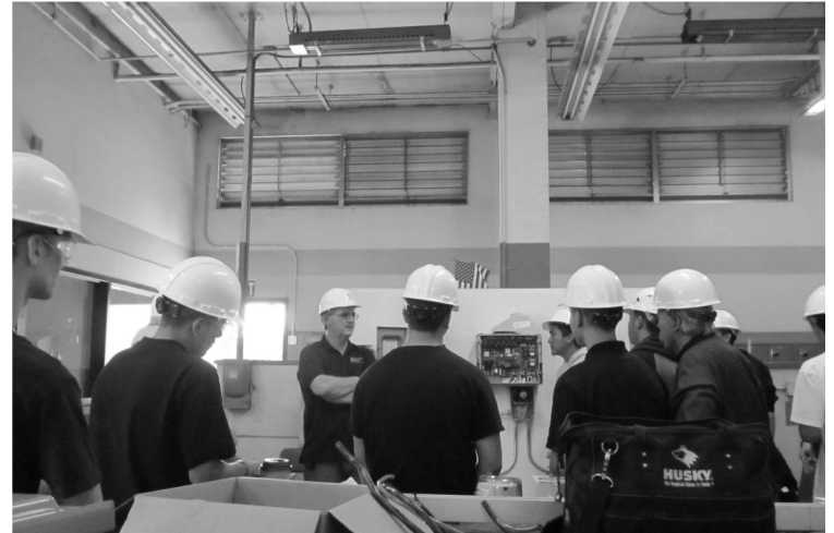
Students listen to instructor in the MVROP class provided by PetersenDean