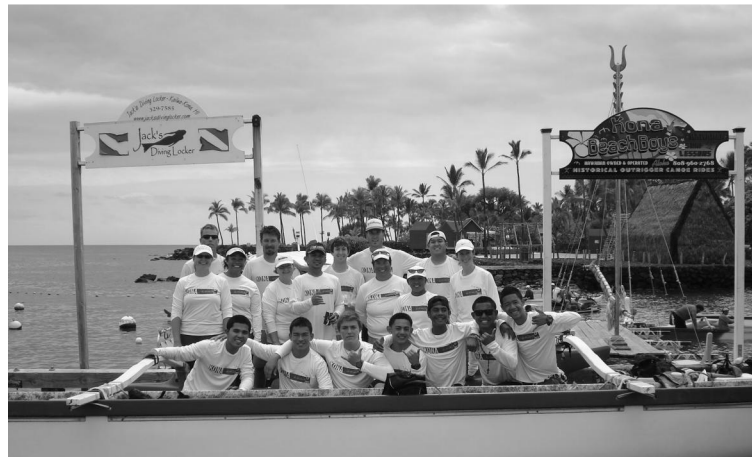
Kilohana Club youth and adult participants in the 2010 Hawaii race

Over the past 14 years, Kilohana Outrigger Canoe Club has offered a keiki (the Hawaiian word for “child”) program to residents in and around Fremont. With its roots originally at Lake Elizabeth, the program has operated at Quarry Lakes since 2001. The club gives youth ages 7 to 19 a unique opportunity to experience the Hawaiian culture that surrounds outrigger canoeing: a culture that emphasizes aloha aina (love of the land), respect for the ocean, and most importantly, ohana (family).