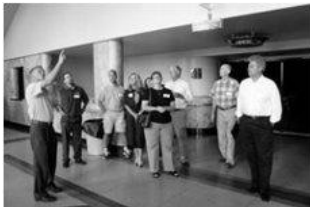
Sustainability Circle participants learn about energy efficient lighting