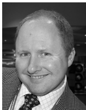
by Angus Cochran Washington Hospital Healthcare System

In its landmark 2010 Citizens United ruling, the Supreme Court expanded the right of corporations to participate in elections. In exchange for this expanded privilege, I think companies now have an increased obligation to contribute to the civic life of the communities where they do business.