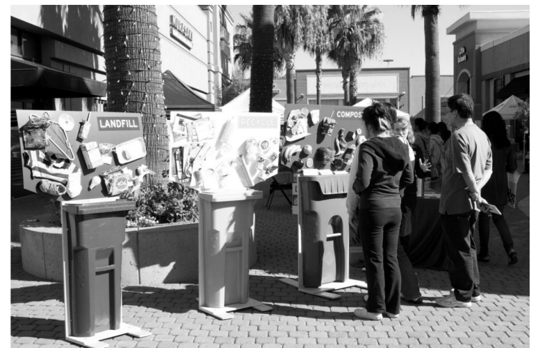
Fremont students are making a difference every day through our service-learning program

Our Board of Education has adopted service-learning to help