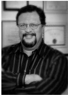
by George Duarte Horizon Financial

Every day in our lives we make a difference whether we know it, or intend it, or not. Whenever we interact with other people, in any capacity, we are affecting them and their day. It is so easy to become wrapped up in the minutia of our own lives that consequently, the concept of "making a difference" can be very overwhelming.