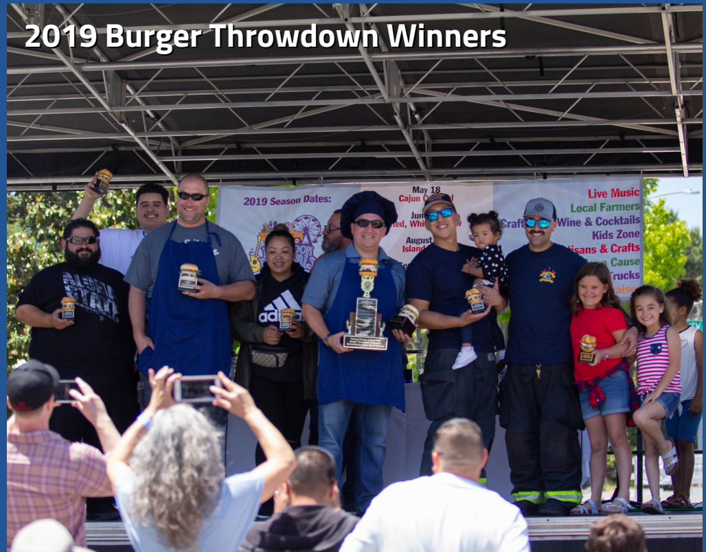
2019 Burger Throwdown Winners