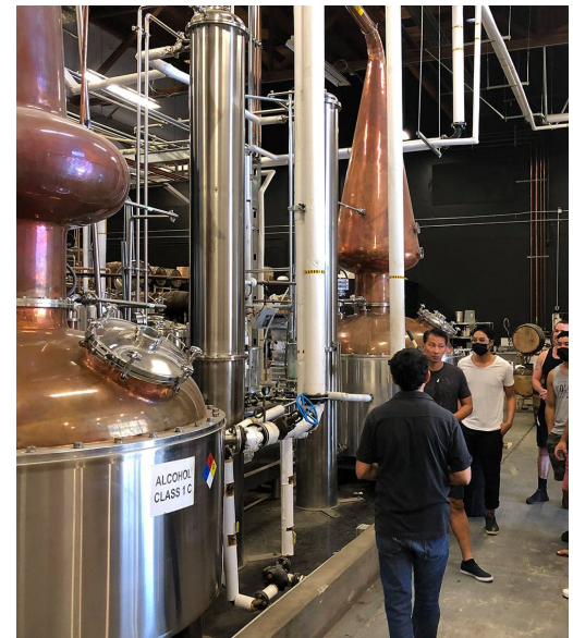
participation/sponsorship of local events (like the Fremont Burger & Brew Fest!)

While the Burger & Brew Fest started with just craft brews in mind, the event has since grown to include a craft spirit tasting option. According to the California Craft Distillers Association the number of active California craft distilleries hit 190 last year, up from just 118 in 2015. With that kind of growth we felt it was high time we branched out to include more of the craft beverages community in our event.