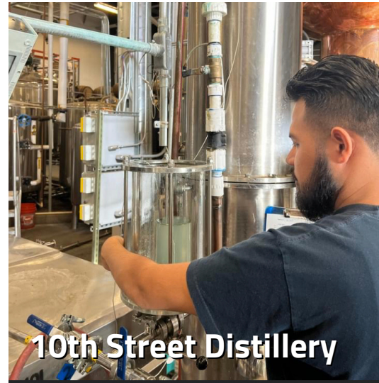
10th Street Distillery

Lending both traditional and innovative brewing techniques and ingredients to design unique, tasty brews.