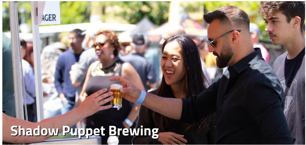
Shadow Puppet Brewing