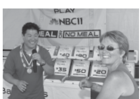
NBC11 is one of the sponsors of the Fremont Festival

In addition, sponsorship space at the Festival is limited and only a select group of sponsors have a commercial presence at the Festival site. This assures high visibility within the Festival grounds. Festival sponsors enjoy