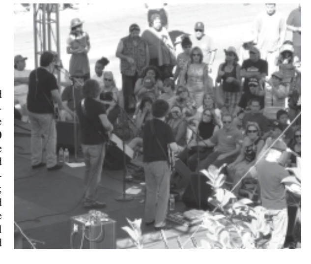
Above: Performers on the Paseo Padre Stage

Right: Unique art can be found at the Fremont Festival of the Arts