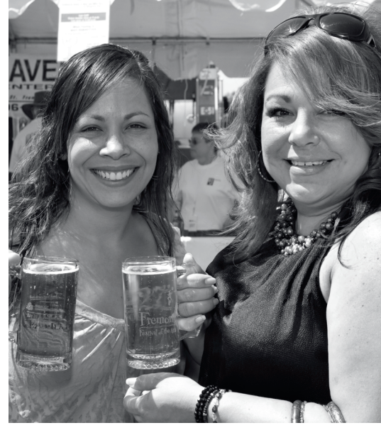
Clockwise, from bottom left: The City of Fremont's prize wheel; wind chimes; friends meet up for beer; margarita madness; beer booth volunteers.